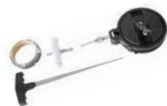
Windshield Joint - Cutting Kit