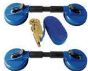
Suction Cup Set With Strap