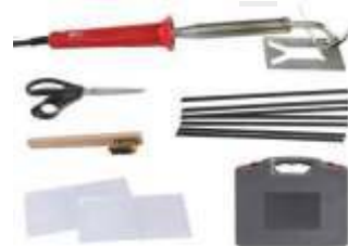
Model : Brazing