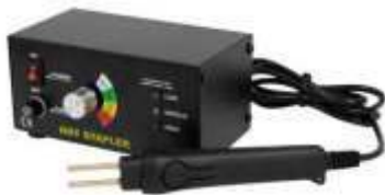
Plastic Repair Kit