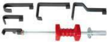
Sliding Hammer Set