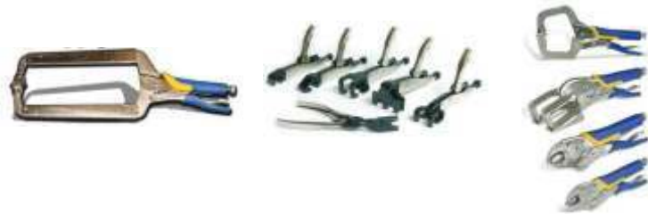
Vice Grip Plier Set