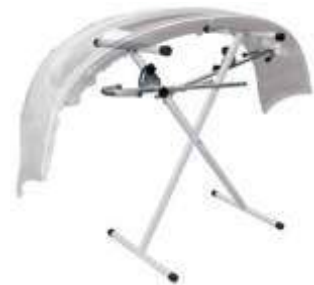
Bumper Repair Stand