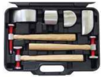
Hammer and Dolly Set