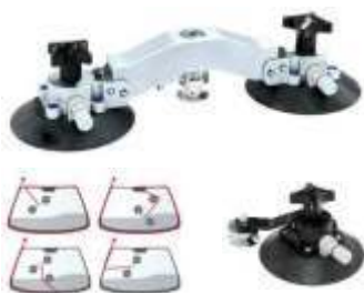
Windshield Cutting Kit