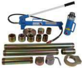
Hydraulic Body Repair Kit 10 Ton (Premium)