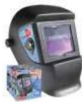
Auto Darkening Welding Helmet